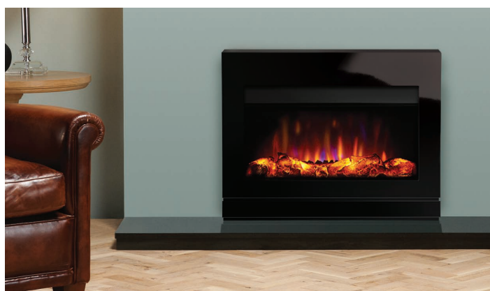
Designio2 Black Glass Fascia