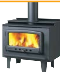
Nectre MkII (legs)