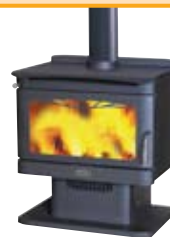
500 & 800 (pedestal)