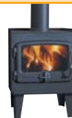
Nectre 15 (legs)