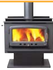
Nectre MkII (pedestal)