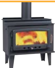
Nectre MkI (legs)